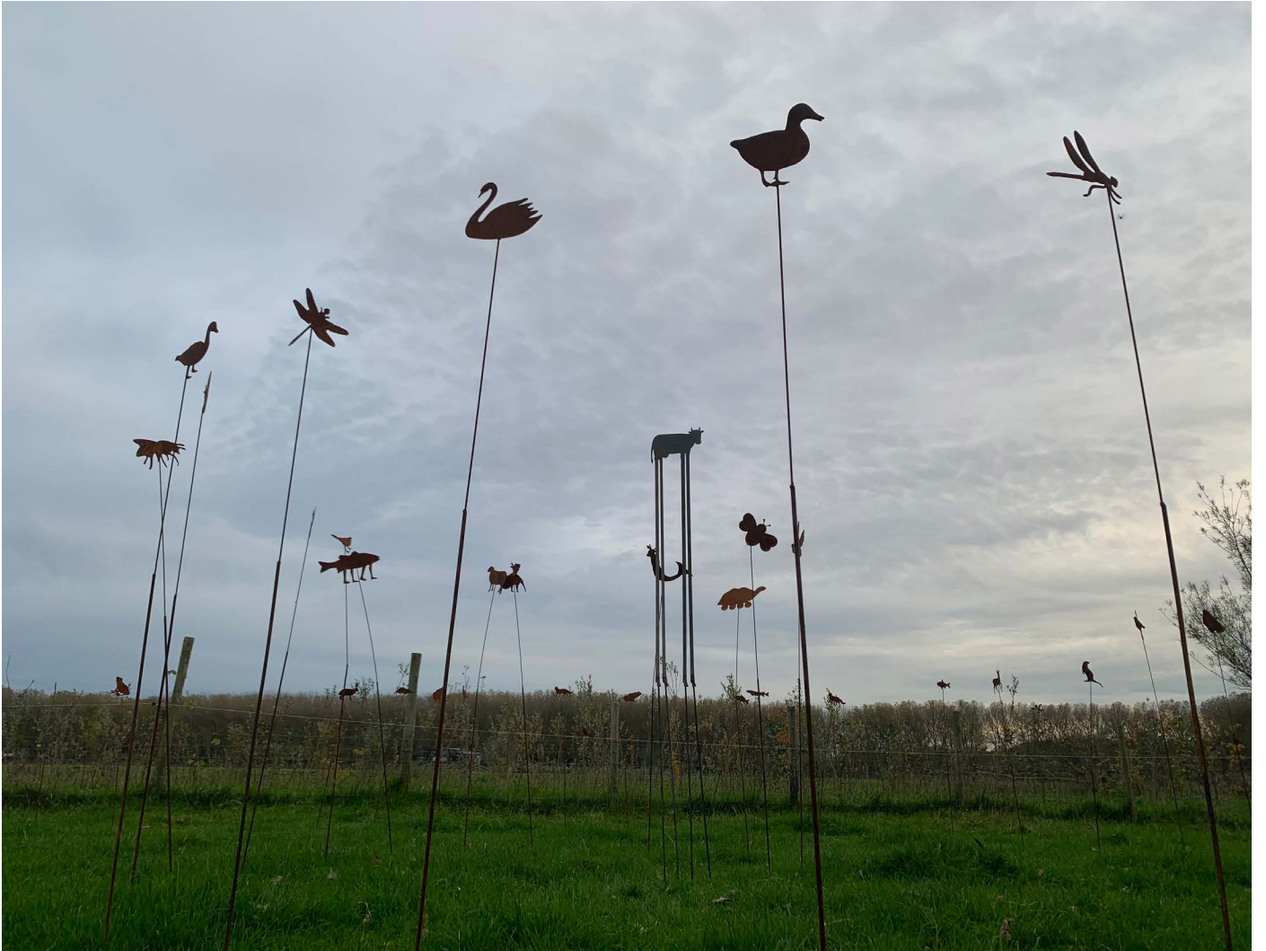
The Golden Spiral of Evolution / landscape exhibition